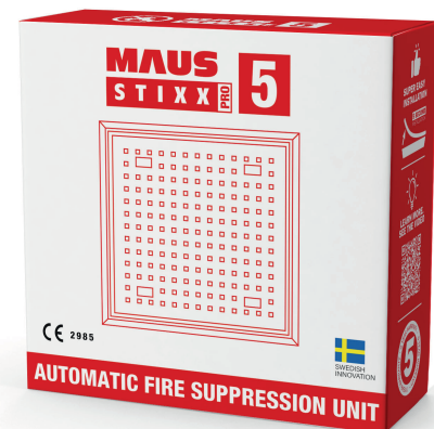
MAUS Stixx PRO 5 product box.

An additional heat detecting cable can be inserted on the side of the unit.