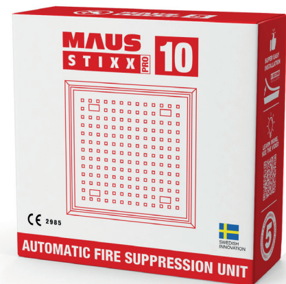
MAUS Stixx PRO 10 product box.

An additional heat detecting cable can be inserted on the side of the unit.